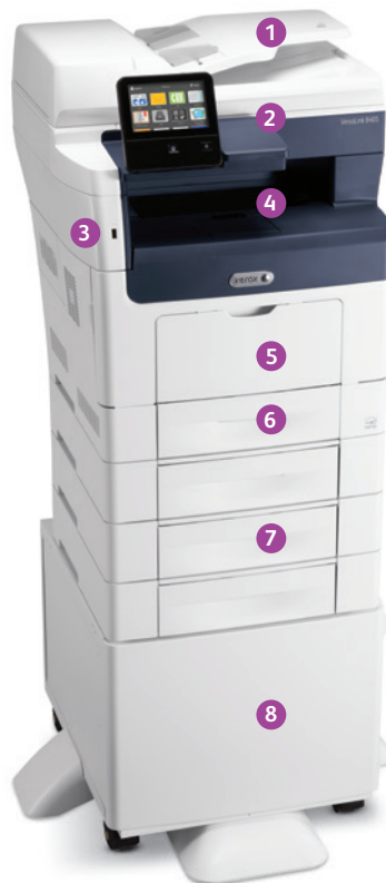
Xerox® VersaLink® B400 Printer Print.